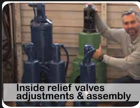
Inside relief valves adjustments & assembly

for more Boiling Point videos: youtube.com/user/wareboilers