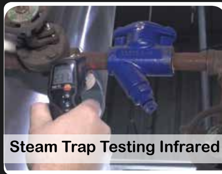
Steam Trap Testing Infrared